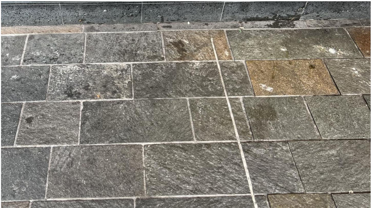
The Cairns CBD's walkways are often stained.

RELATED: CBD bar forced into action against population of drunks, itinerants