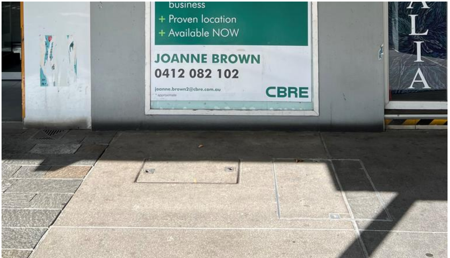
For-lease signs are dotted throughout the Cairns CBD and there are about 80 vacant ground-level premises.