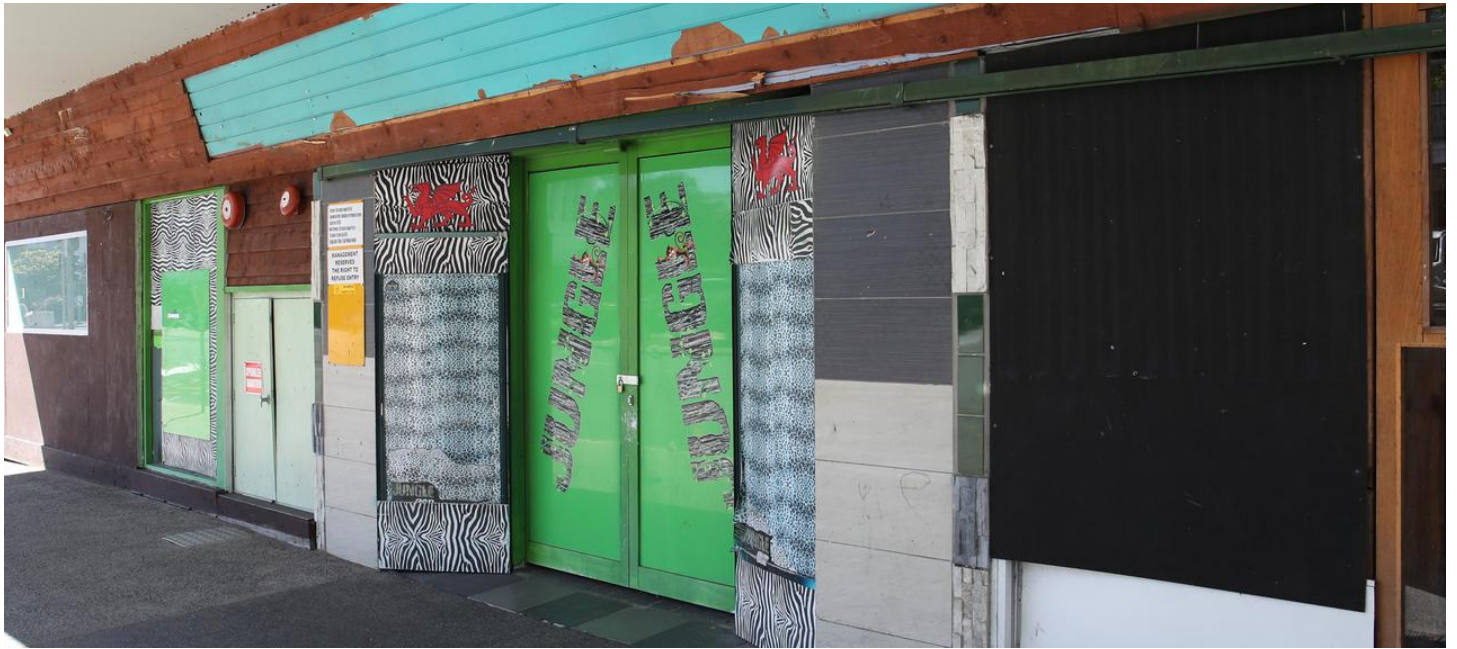
The former Mad Cow and Casbar nightclub on Spence Street.

The former Mad Cow building is one of many in a string of abandoned properties around the Far North.