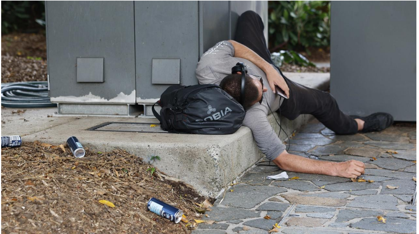
People sleeping in the CBD is a common sight.