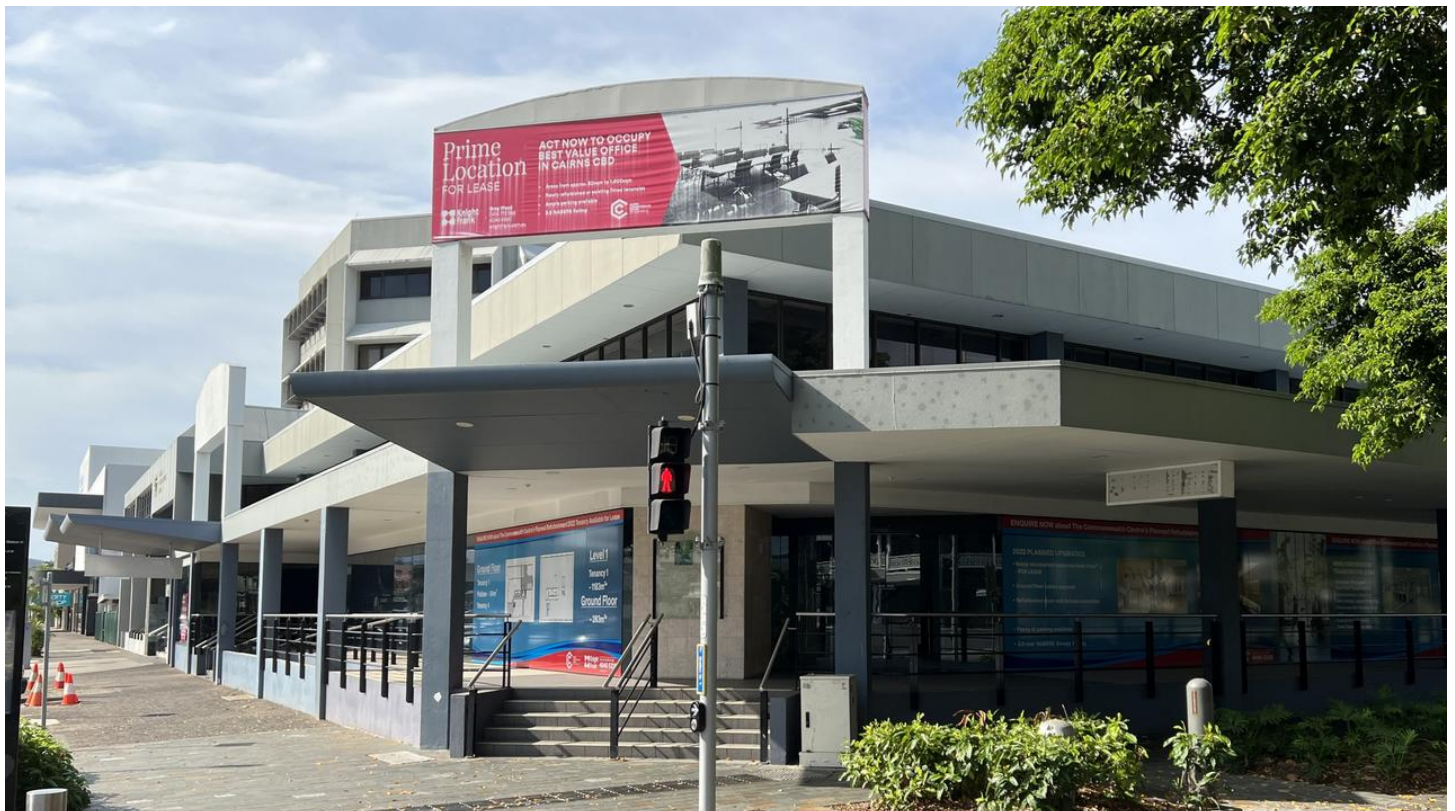
A familiar sight at the corner of Shields and Grafton streets where the for-lease sign has been displayed for months.

“It takes time to build up demand, business just doesn’t bounce back in 24 hours.”